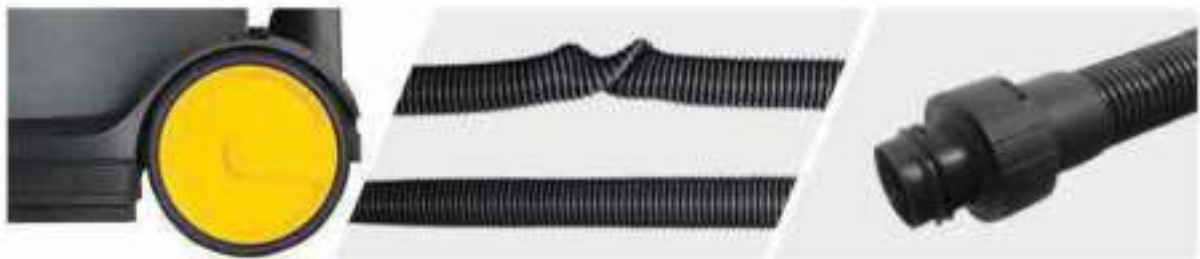
CASTERS FOR SOLID SUPPORT