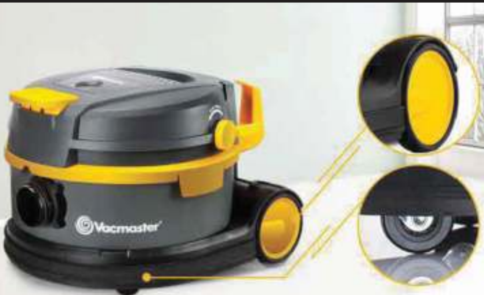
Enlarge Rubber Wheel