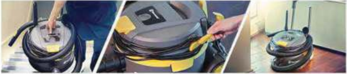
FLAT TOP MOTOR UNIT DESIGN FOR RESTING